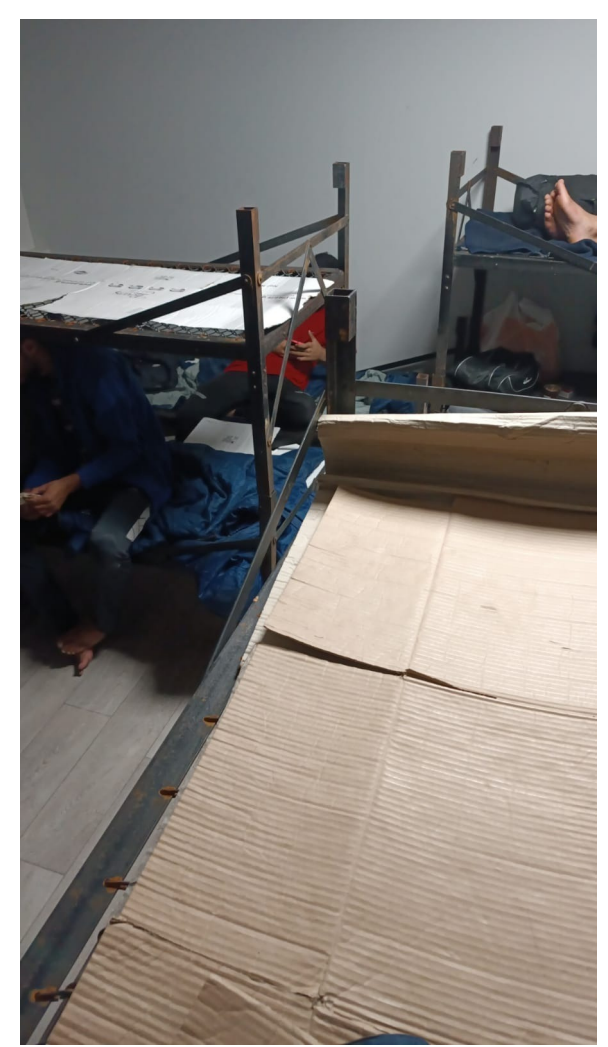
© I Have Rights Pictures sent to I Have Rights by residents of the CCAC.