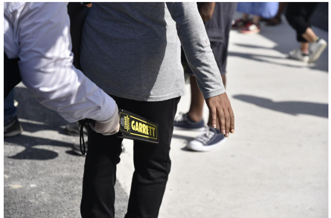
© Romy van Baarsen_ Romy Aimee Photography

As asked by S, the proportionality of a weekly census is questionable considering that people can only enter and exit the CCAC through scanning their fingerprints and showing identification documents.