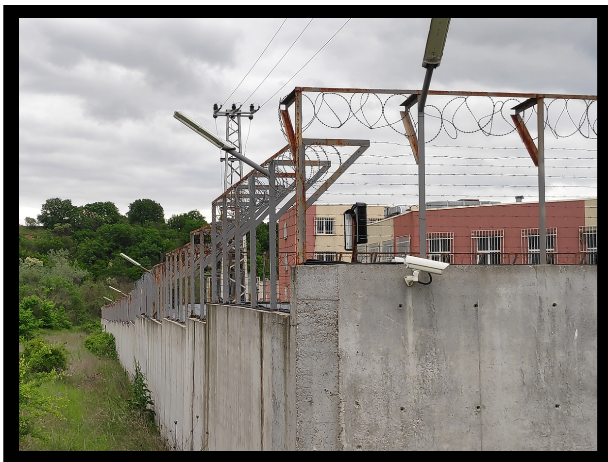
Pastrogor Transit Centre.

Maintaining the Parliament position's provision under Article 6(5b) is absolutely necessary in order to prevent secondary legislation from superseding primary EU and international law. Without free legal aid, individuals will be left without the ability to exercise their rights or to challenge violations of them. The Bulgarian case demonstrates how such dynamics are already underway and pose a significant risk to the rule of law in the EU.