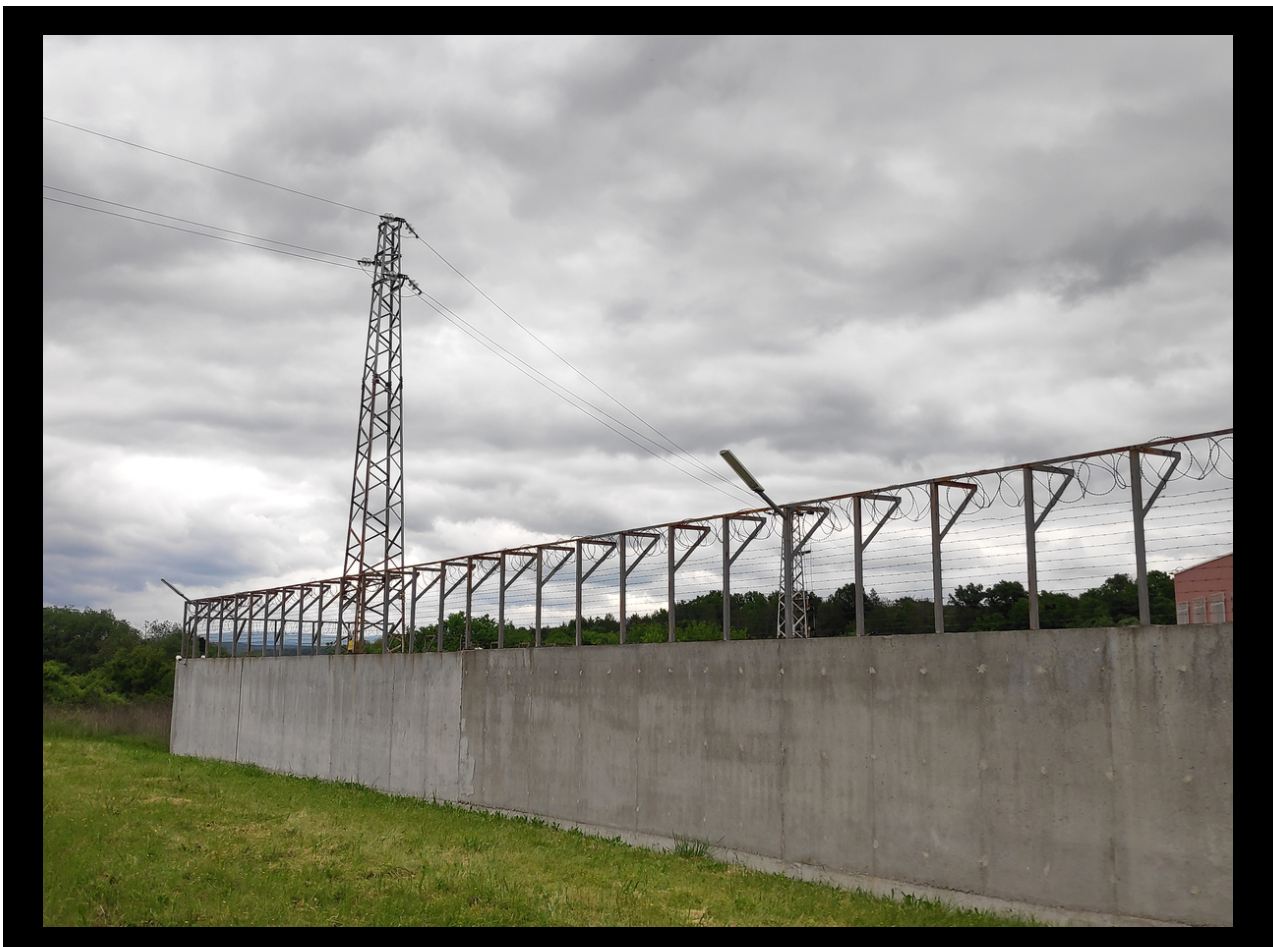
Pastrogor Transit Centre.

The legally contested fiction of 'non-entry' has been heavily criticised by civil society and legal practitioners. Given the significant restrictions that it poses on the fundamental rights of people on the move, the salient risk of refoulement and the severe inhibitions it places on individuals freedom of movement, Article 4 should be removed. In the situation that it remains, measures must be implemented to prevent arbitrary detention. This entails conducting reception in suitable open facilities, accompanied by well-defined rules regarding detention conditions complete with the legal basis and required safeguards, and guaranteed access to free legal aid. Access to third parties in screening centres should be unconditional and free from any restrictions imposed by authorities or centre management. Finally, a non-exhaustive list of third parties should be included to prevent a narrow interpretation of the law.