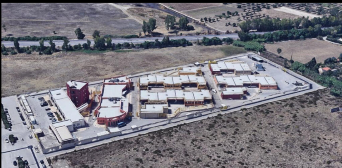
© In Limine - ASGI. Trapani and Pantelleria CPRs.