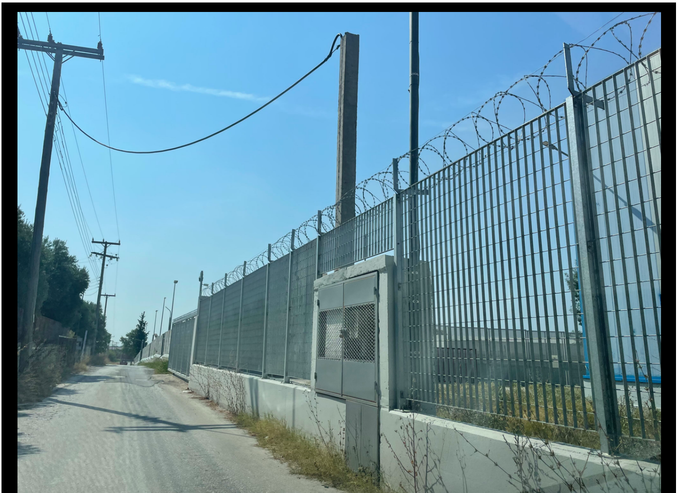
XX Reception and Identification Centre.

The addition of Article 6(6d) from the Parliament position would ensure safeguards by mandating Member States to provide adequate conditions in line with the Charter for individuals undergoing screening is essential. To avoid the unlawful detention of asylum seekers and any breach of international law (including Article 31 of the 1951 Refugee Convention), the removal of any provision requiring the detention or restriction of freedom of people on the move awaiting the completion of a screening procedure is necessary.